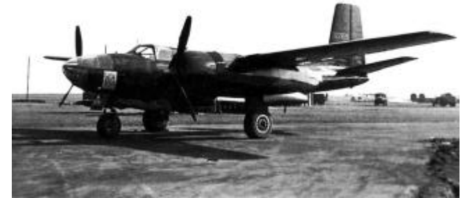
A26 Invader used on 'Red Stocking' Missions

(Bus Parties please give prior notification)