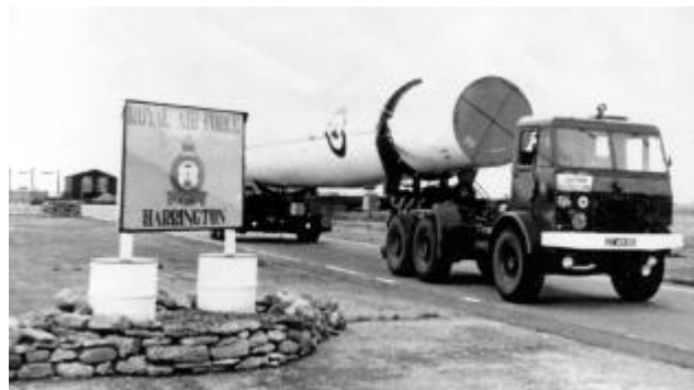
The last Thor missile leaving RAF Harrington in 1963