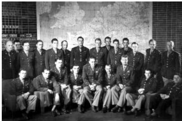
492nd BG Staff Officers 1944