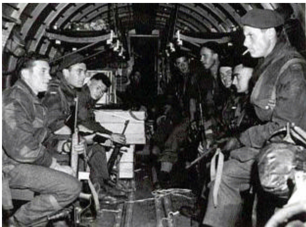
OSS Operations Group en-route to France August 1944