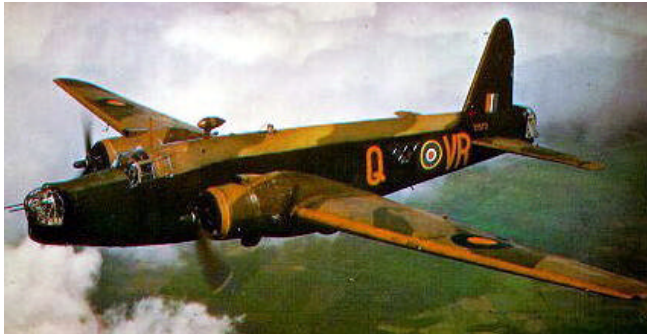
Vickers Wellington, also known as the 'Wimpey'

Exhibits also include Home Front displays, instrumentation and other fascinating items of equipment and memorabilia