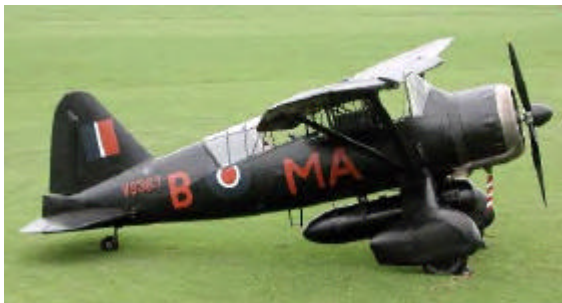
Pick up Lysander as operated by 161 Sqn RAF

Other displays show the vast secret agent and supply network masterminded by the British Special Operations Executive (SOE) and operated from RAF Tempsford. The story of the Royal Observer Corps and the Cold War role of the Thor missile base at RAF Harrington are also fully described