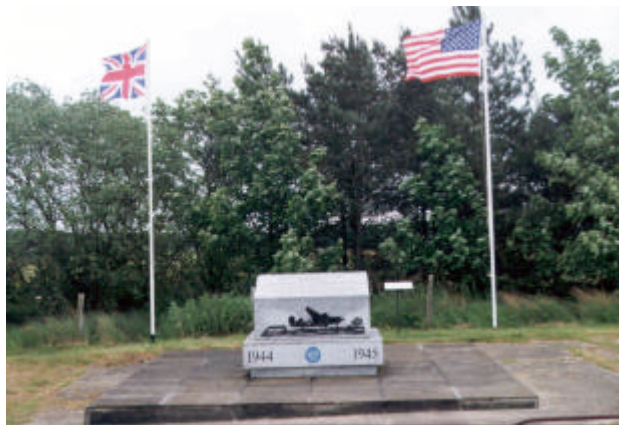
Harrington Airfield Memorial