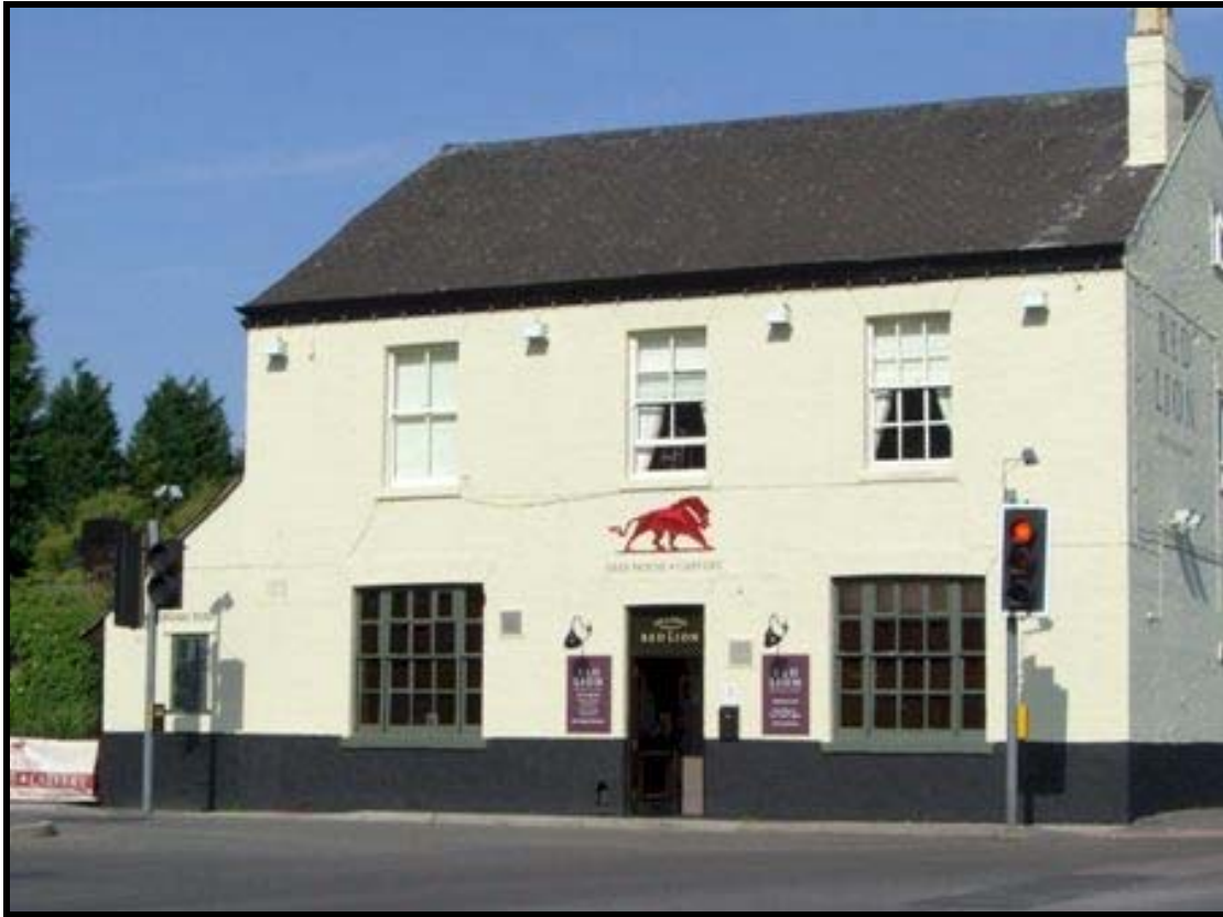
The Red Lion, Rothley, Leicestershire, 2010