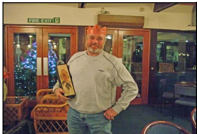
Who's a lucky boy then?