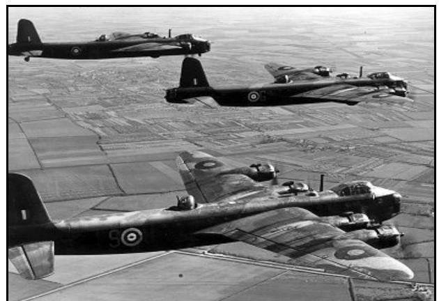
Short Stirlings 161 Squadron.

On leaving the target area the aircraft climbed to 3000 feet and a course was set for Tempsford. A short time later a call was received from the rear gunner, "Skipper, we have a follower. I cannot see what it is and it is out of range, but there is something there". We dropped to 2000 feet and did a 'Dog Leg' but the gunner reported that he was still with us and had followed us down. Heavy snow showers were then being encountered, and it was decided to go down even lower to make an attack from above and astern dangerous. Again the gunner called "He's still with us, but not in range" A radio message was then received from Group that Tempsford was now fogbound and that all Tempsford aircraft were to divert to Lyneham.