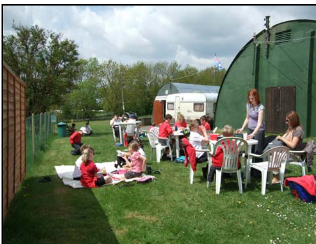
A well earned break.