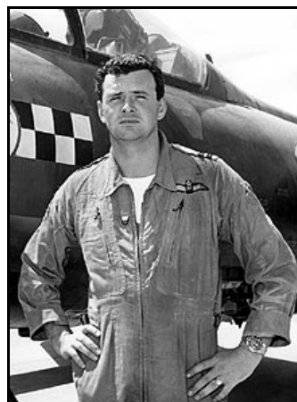
Wing. Cmdr. Bill Stoker 1935—2010

Then in 1963 he joined No 43 Squadron and was in the front line of the British withdrawal from Aden, flying air operations in support of the Army in the Radfan Mountains. One veteran of 43 Squadron commented: "We were laying down fire as close as 25 yards to our own army positions."