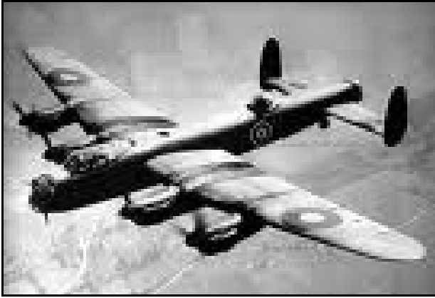
A 'lost' Lancaster?

his transmission when a further shout was received from the rear gunner –“ I can see him Skipper. It's definitely twin engine and coming closer – hang on, it's a b..... Lanc!”