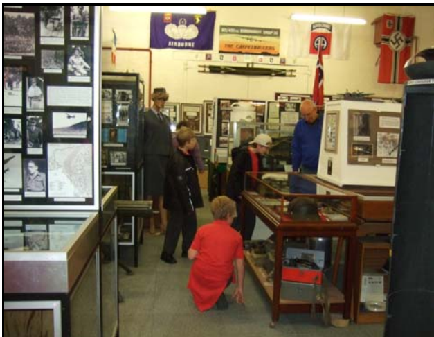
What's that for Graham?