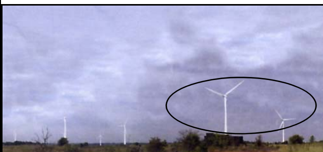
How it might have been. Numbers 3 and 7 turbines with a Thor missile site in the foreground.

Mrs Fieldhouse must have been favourably impressed by all the arguments against the project, for she eventually dismissed the appeal. And the old base slumbers peacefully once more. (But, don't be surprised if the question of wind turbines crops up again in the future.)