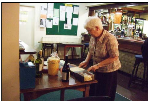
Shall I take the chocolates?