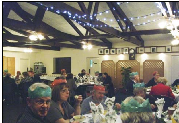
And it's eyes down for the first course.