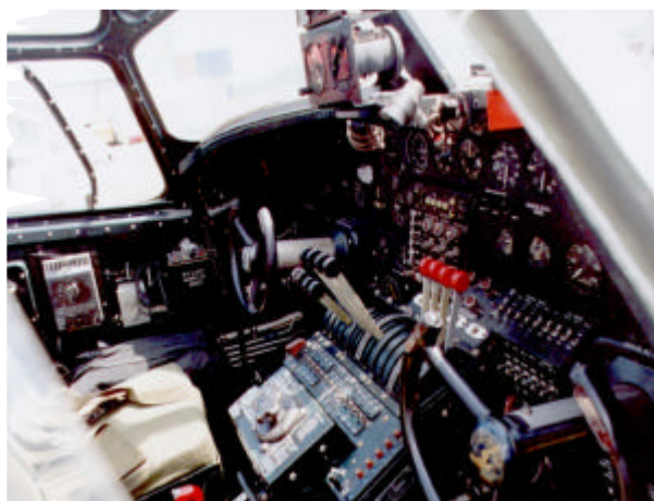
Cockpit of B24 J 44-44052 'All American' taken in 1993

Belongs to Kermit Week's Fantasy of Flight Museum at Polk City, Florida, USA. Originally assigned to 215 Sqn RAF, India and then flew with the Indian Air Force until 1973