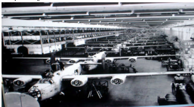
Ford's Willow Run B24 assembly line

Belongs to the Collings Foundation in the US and is the second still in flying condition. Served in the Indian Air Force as as KH191. In recent years it has appeared at air shows as 'The Dragon and his tail' representing 44-40973 of 64th BS, 43rd BG